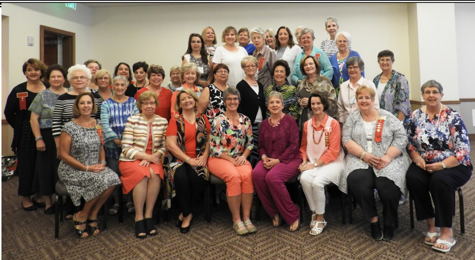
North Carolina delegation at International this July in Austin Texas