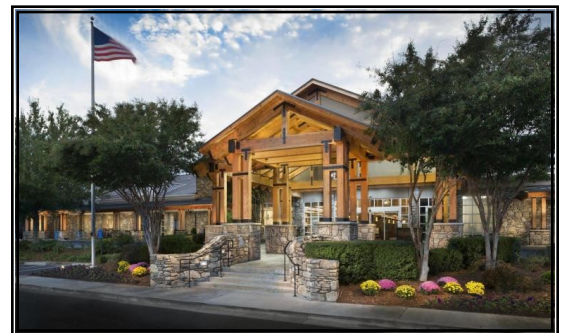
International Conference: Arts & Humanities