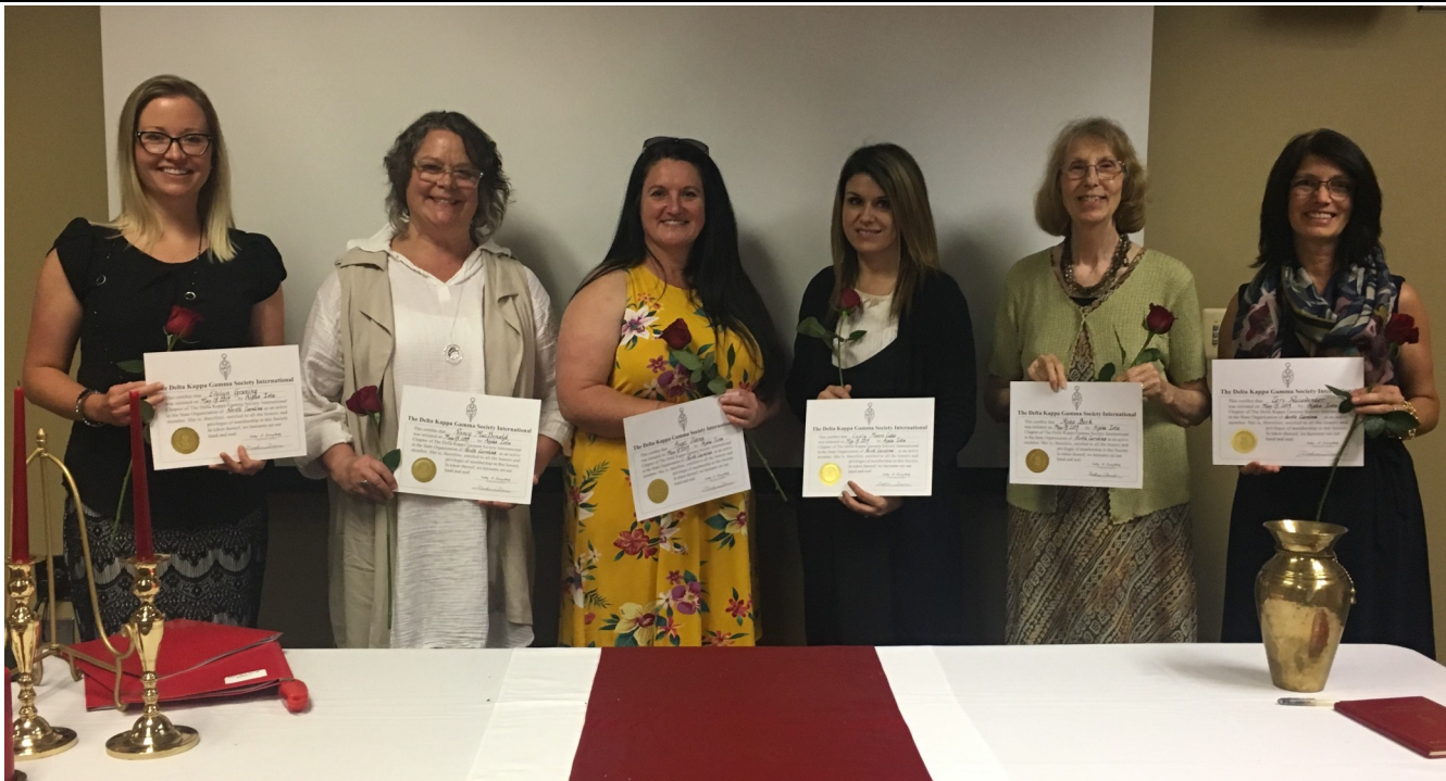
Six new members were inducted into Alpha Iota Chapter on May 18th 2019.