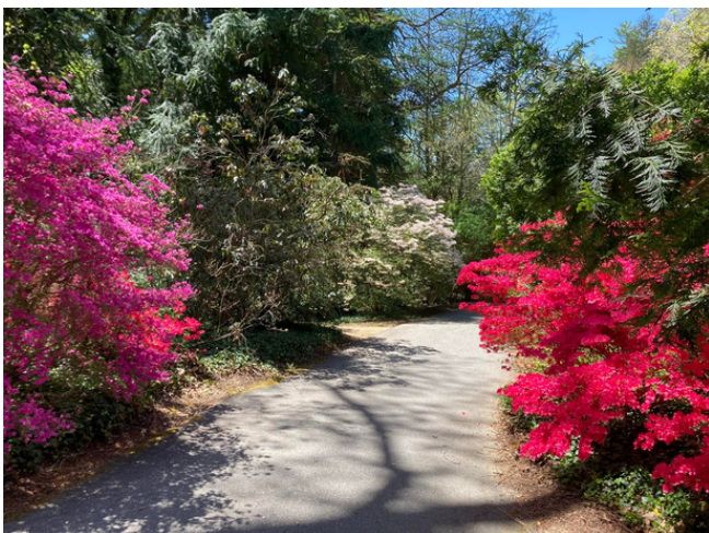
Azalea path at Biltmore

The entire Schedule at a Glance with times and places is posted on the convention website and will be on the inside cover of the convention program.