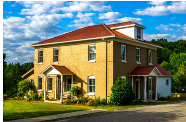
Clay County Historical & Arts Museum. 21 Davis Loop in the old jail.