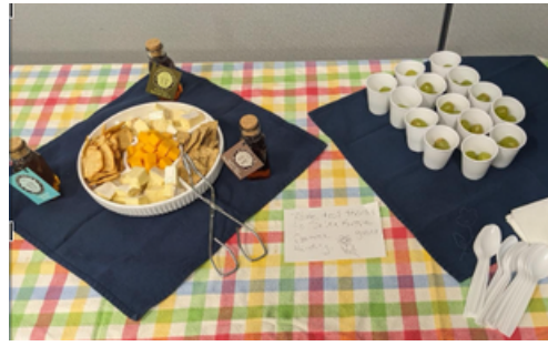
Pictured: Taste test table.

April Tallant received a $75 mini-grant to provide a program for WCU faculty, staff and students called, "Intuitive Eating for Well-being." Tallant, a registered dietitian, presented the ten principles of intuitive eating and provided a taste-test including various cheeses, gluten free crackers, sweet rolls, blueberry lavender fruit spread, apple pie fruit spread, grapes, and three types of local honey.