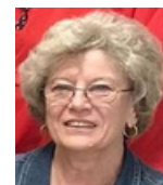
PARLIAMENTARIAN SUZI CABE